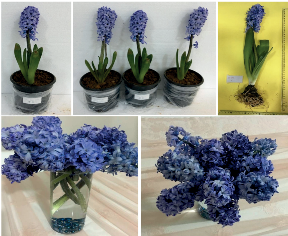
Fig. 1. Flowers of Hyacinthus orientalis cv. ‘Delft Blue’.

Hyacinthus orientalis cv. “Delft Blue” commercial bulbs were used as plant material in the experiment (Fig. 1). Bacteria contaminated with bulbs were selected from nitrogen fixing and phosphate solubilizing species and were obtained as stock from Siirt University, Faculty of Agriculture, Department of Field Crops. Nitrogen-fixing Cellulomonas turbata (TV54A), phosphate solubilizing Bacillus -GC Group (TV119E)